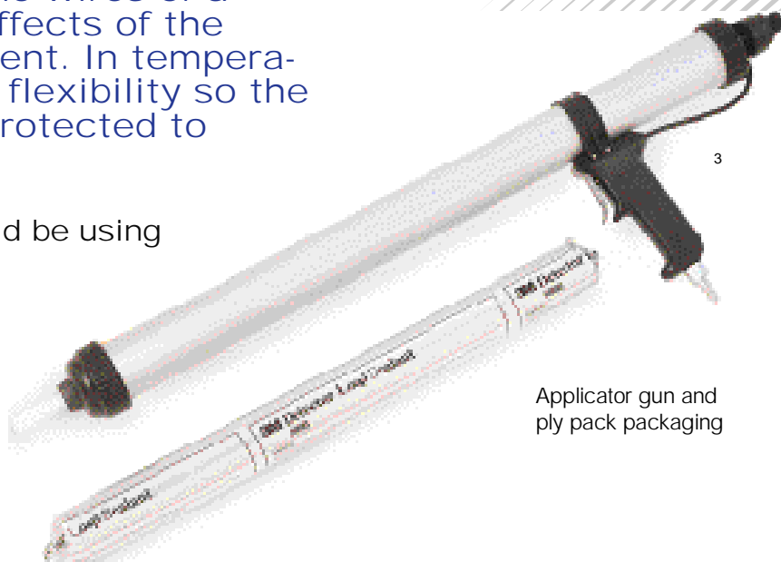
Applicator gun and ply pack packaging

3M's new ply pack is especially well suited for customers who use applicator guns to apply sealant. Dispensing rate is improved by up to 300%. Disposable packaging waste is reduced by over 90% at the work site.