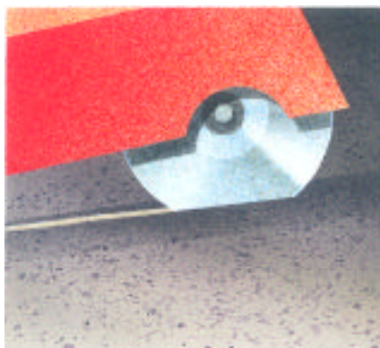
1. Cut the loop.

* All results based on 3M laboratory testing.