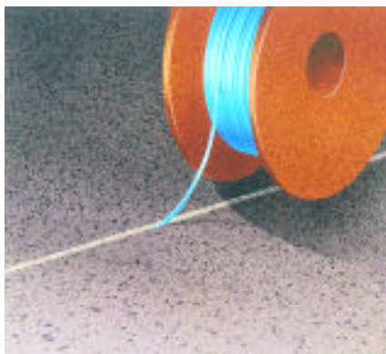
3. Install loop wires.