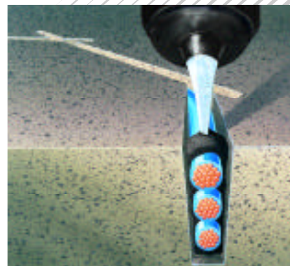
4. Fill sawcut with 3M ® Detector Loop Sealant.